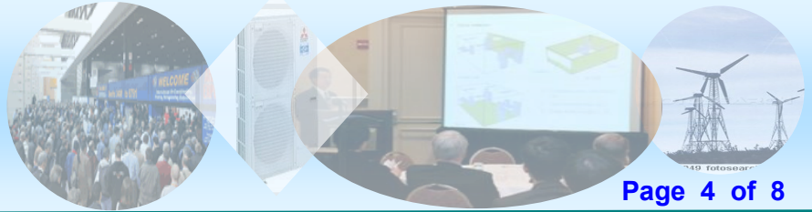
TABLE TOP DISPLAY

The November 2016 meeting will host two Table Top Displays! Jeff McCracken will provide presentations for products manufactured by Armstrong Fluid Technologies (Armstrong). Armstrong manufactures intelligent fluid flow equipment for HVAC and plumbing applications and various other industries. Rene Plourde of Victaulic will be providing the second table top display. Victaulic provides a broad range of mechanical pipe joining solutions as well as a variety of grooved pipe fittings, couplings and products.